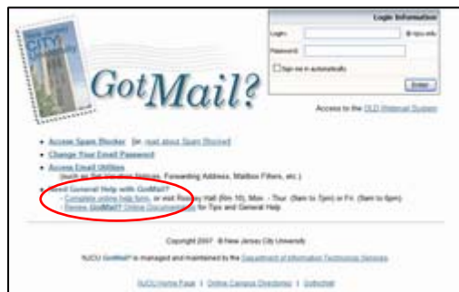
Figure 2. NJCU GotMail? login page. Account help in lower left (circled).

If you get a login error, your account and/or password information may be incorrect. If this is the case or you do not have your account information, you have two options: Visit in person, or use the secure support form that is linked on GotMail? login page, below the login prompts.