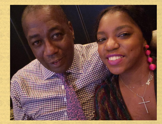
I will miss you forever. You made the world a better place. Love,