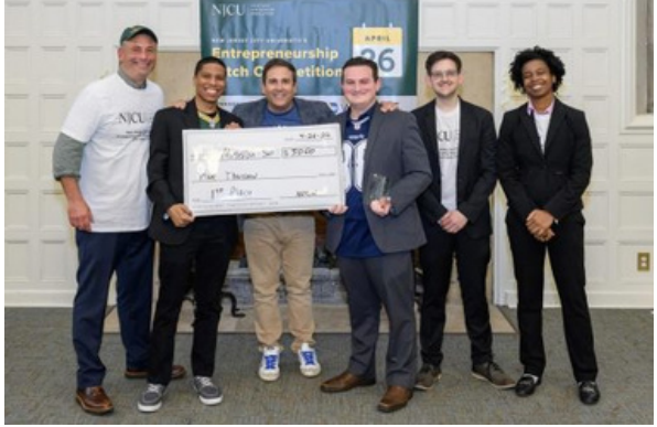
Photo Caption: The first-place prize for the competition was $5000. The winners moved on to a final round against three other colleges from Hudson County.