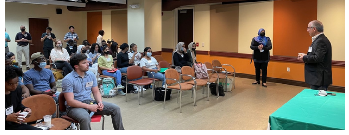
Photo Caption: 2022 Summer Research Internship Program Orientation