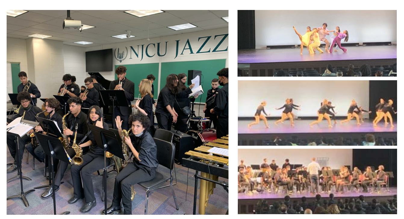
Photo Captions: Hudson County Alliance of Teen Artists, Performance Festival