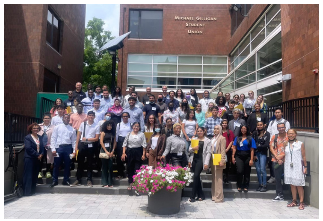
Photo Caption: Student interns, faculty mentors, support staff, and community partners at the 2022 Summer Research Internship Program Final Presentations.

NJCU's STEM departments provided more than 400 paid summer research internships over the past 20 years through U.S. Education Department Title III and Title V support. Students are drawn from NJCU's Biology, Chemistry, Computer Science, Earth Science, Finance, Mathematics, Nursing, Physics and Psychology Departments.