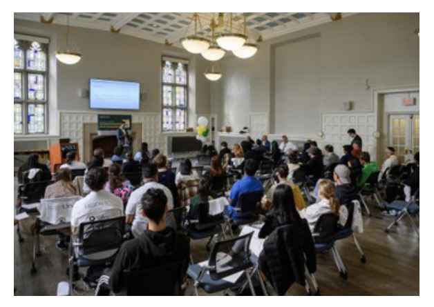
Photo Caption: The pitch competition took place on April 26 in the Gothic Lounge at NJCU. Photo by Paul Gargiulo..