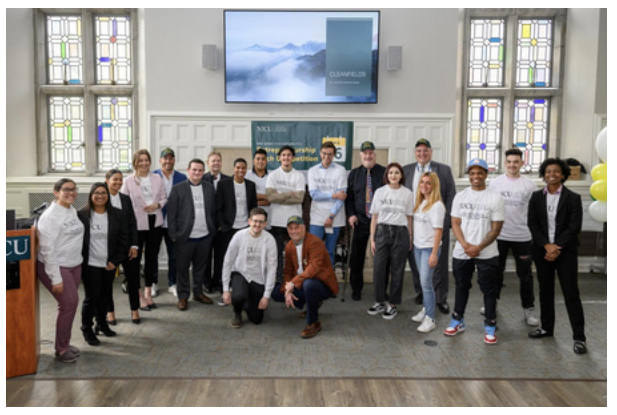
Photo Caption: The competition was sponsored by NJCU's Institute for Dispute Resolution (IDR), Mission 50, Valley Bank, and the LVE Group.