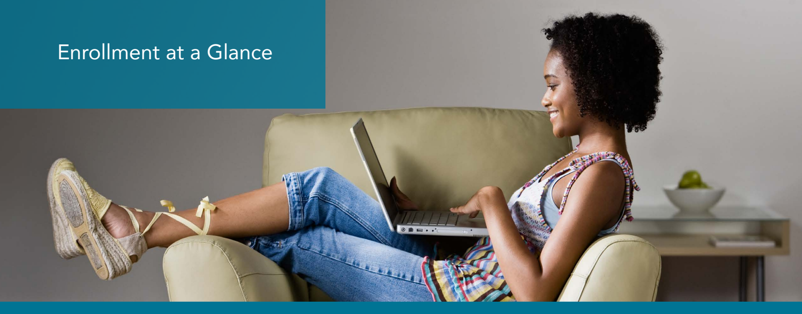
Important Dates to Remember