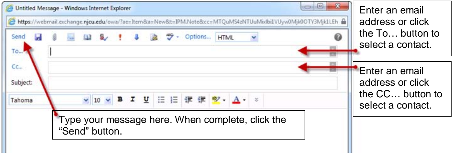
Figure 2. Top section of New message window