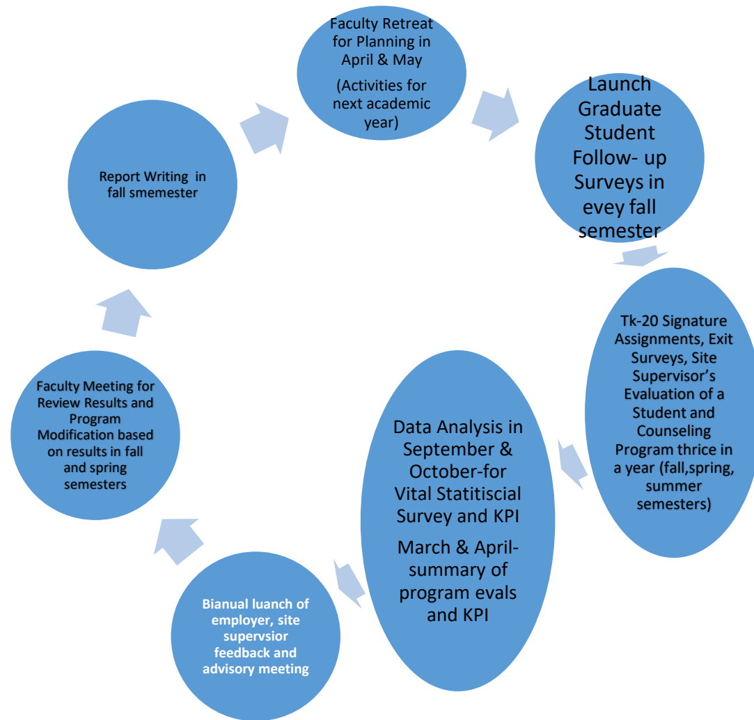
Figure 2 Final Comprehensive Assessment Timeline