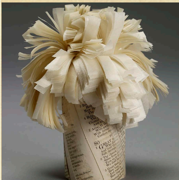
Carole Kunstadt Sacred Poem XXX

Carole Kunstadt's exploration of book as art began with an 1844 book of Psalms she discovered while looking for collage materials. By meticulously slicing and sewing, Kunstadt creates exquisite objects which call to mind religious relics. The holy text is undecipherable, shifting the inherent value to the object itself.