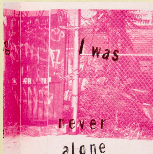
Aileen Bassis In My Country

Carole Kunstadt's exploration of book as art began with an 1844 book of Psalms she discovered while looking for collage materials. By meticulously slicing and sewing, Kunstadt creates exquisite objects which call to mind religious relics. The holy text is undecipherable, shifting the inherent value to the object itself.